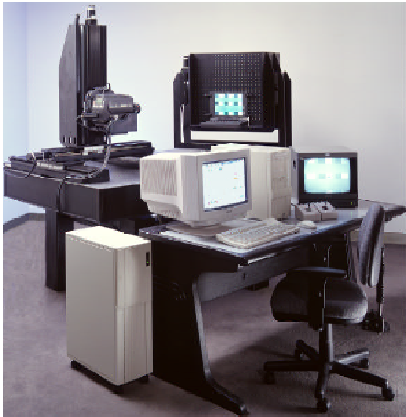
Photo Research has been the leading supplier of light measurement equipment to the display industry for more than 50 years. Our world renowned expertise in display measurement has culminated in the development of an integrated, turnkey FPD Tester, the PR ® -9000, that combines speed and precision to reduce test times by several hours in both R&D and QC/QA environments.